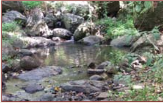
Reesville creek (below) and panorama (right)